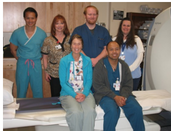
Our friendly Radiology staff

Boulder City Hospital strives to keep its community healthy and encourages early detection to prevent harmful conditions. If you suffer from or are at risk of osteoporosis, we encourage you to talk to your doctor about the benefits of a DEXA scan. Boulder City Hospital's DEXA scanning equipment is state of the art and offers painless, non invasive scanning that takes approximately 10 minutes.