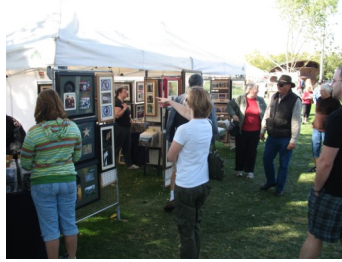
Scenes from Art In The Park